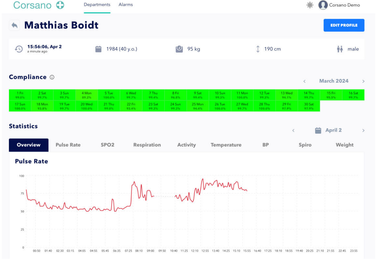
Select a department to see the patient list. Then click on a patient to see details